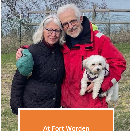
At Fort Worden